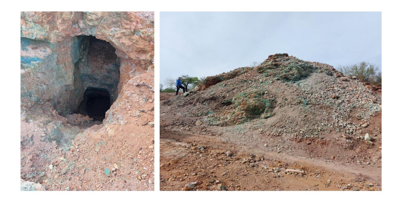
Photo 2 – Access to some of the historic copper mining areas present within the Suaqui Verde Project area

The Company is not treating any historical estimates described in this release as current and the Company's QP has not completed sufficient work to classify these historical estimates as current mineral resources. While the Company is not treating these historical estimates as current resources, it does believe the reference work conducted by Grupo Mexico, Summo and others, is reliable and the information may be of assistance to readers. The Company intends to commence work on a new resource estimate for the Suaqui Verde project including a data review to determine what is required to fully update the historical mineral resources to a current standard.