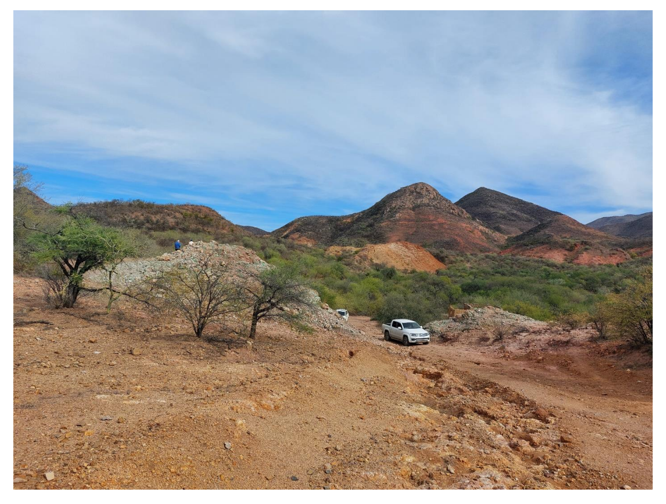
Photo 1 – View of mineralized alteration surrounding Suaqui Verde Project with dumps from old workings in foreground

The Company is not treating any historical estimates described in this release as current and the Company's QP has not completed sufficient work to classify these historical estimates as current mineral resources. None of the historic resources described in this release are NI43-101 compliant and should not be treated as such. While the Company is not treating these historical estimates as current resources, it does believe the reference work is reliable and the information may be of assistance to readers. The Company intends to commence work on a new resource estimate for the Suaqui Verde project including a data review to determine what is required to fully update the historical mineral resources to a current standard.